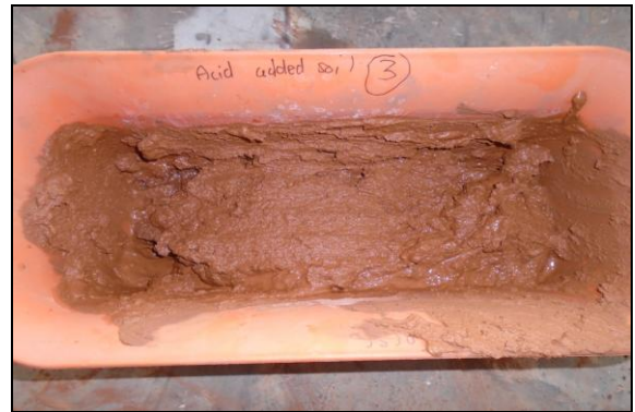
Fig. 1: Plastic pot containing acidic solution added soil

For knowing the importance of cow from vedic scriptures books like Bhagwat Geeta, Shrimad Bhagvatam, Saint Tukaram Gatha, Nyaneshwari, Puranas, websites related to vedic scriptures were viewed and studied.