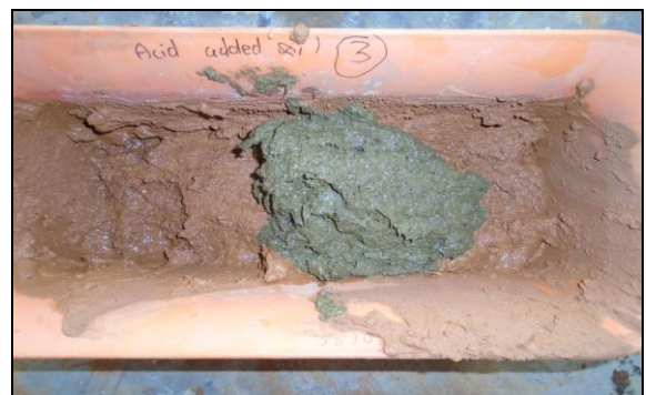
Fig. 2: Plastic pot containing acid added soil with cow dung added