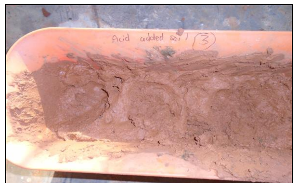
Fig.3: Plastic pot containing acid added soil mixed with cow dung