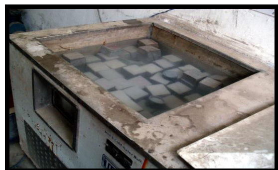
Fig.2: Curing of cement mortar cubes in Curing Chamber of Indian Institute of Engineering Science & Technology, Shibpur’s(IESTS) Concrete Laboratory

The materials used were Ordinary Portland Cement (OPC) of 43 Grade of Ambuja make, natural river sand, drinking water and nanomaterials viz. Nano Silica (NS), Multi-Walled Industrial Grade Carbon Nanotubes (CNTs) & Nano-Titanium Oxide (TN).