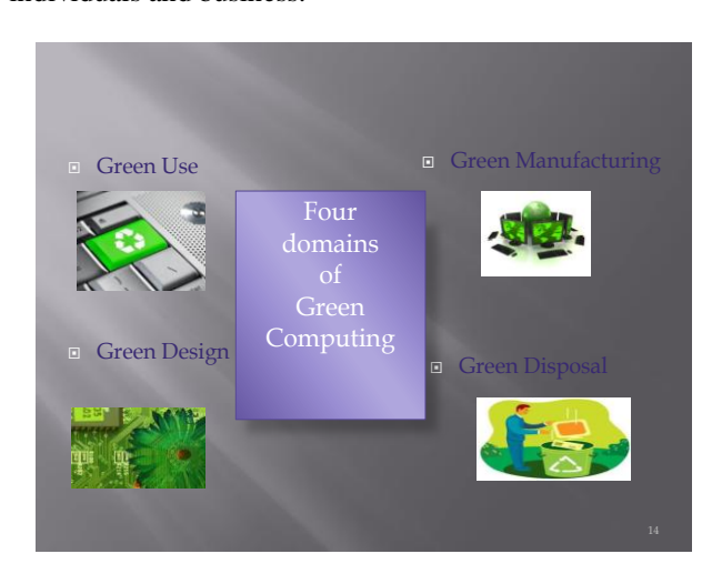
Fig.1: Green Computing Process

Various energy effective strategies should be implemented in data centers to make an eco-friendly data center. Green computing is to be added in government policies to improving recycling and lowering energy use by individuals and business.