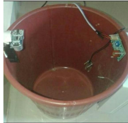
Fig.4: Ultrasonic sensor device placed over the bin

Here the Ultrasonic sensor device and LCD screen is placed over the garbage bin to detect the waste level (figure 4). LCD screen is to display the amount of waste in the garbage.