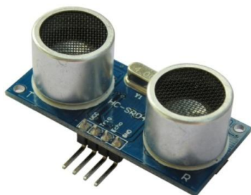
Fig.3: Ultrasonic sensors