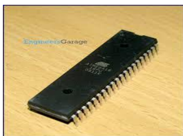
Fig.2: AVR Microcontroller

This will monitor the garbage bin and inform about the level of the garbage collected in the bins. It is an efficient system to automate the cleanliness drive for the city because, automatic garbage reporting and cleaning is done. This method also saves fuel of garbage collection vehicle because, they don't have to go and see which one is filled and which one is not filled. Device used in this system are AVR microcontroller (figure 2), WIFI modem, LCD display, ultrasonic sensor (figure 3), Resistors, capacitor, diodes and transformer. Here the LCD screen is used to display the status level of garbage collection in the bins which shows the garbage level. Microcontroller internally connected to LCD display and also WIFI modem for internet connection. Microcontroller used to process comment send by the sensor.