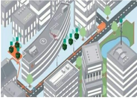
Fig.6: Signal Indication