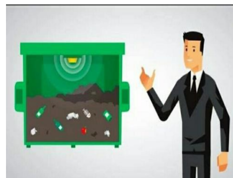
Fig.5: Measuring the Waste in Garbage

Ultrasonic sensor device will detect and measure the waste in the garbage (figure 5). Direct current (DC) voltage such as from a battery or DC power supply will not work in a transformer. Only Alternating Current (AC) makes a transformer works. The magnetic field flows through the iron core. A rectifier is an electrical device that converts the Alternating current (AC), periodically reverses direction, to Direct current (DC), which flows in only one direction. The process is known as rectification. Regulator is a device for controlling the level or amount of something such as speed or temperature. It sends the message to the cleaner authority via Global System for mobile (GSM) modem. Then display status of dustbin on Personal Computer (PC) with Graphical User Interface (GUI) and it will repeat this process. So the application of IoT is needed here. When the garbage is filled then the sensor device will indicate a signal (figure 6) and the garbage collector will collect the garbage. This process will be continued again and again.